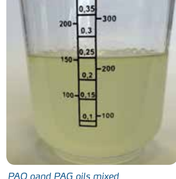
PAO oand PAG oils mixed