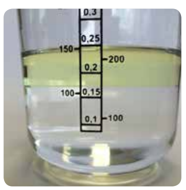
PAO oil (top) and PAG oil (bottom) poured into a vessel

Universal oils do not mix the same way with the refrigerant as the PAG oil, thus the lubricant circulation in the system may be restricted exposing the compressor components to friction and the system other components such as expansion valve or seals to fail